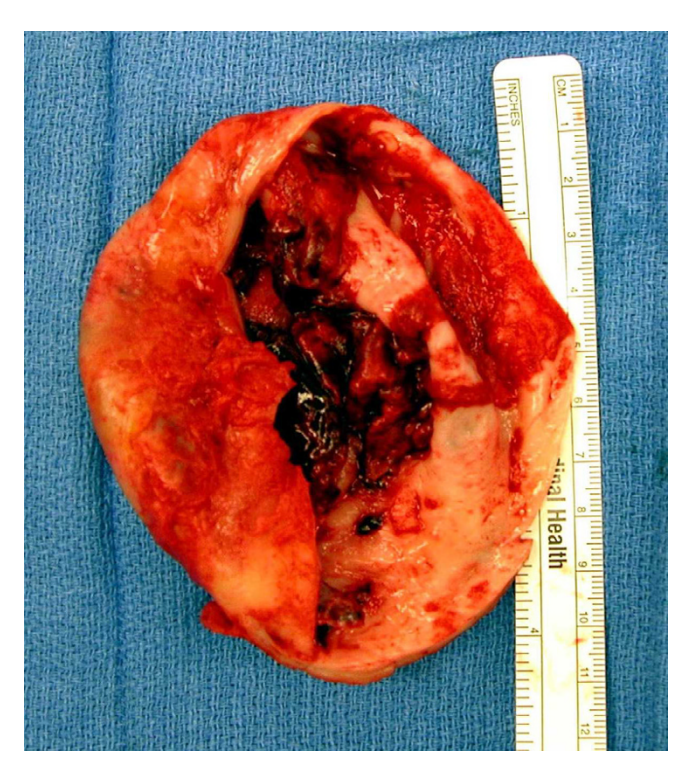
Figure 2 Photograph of resected 10 cm aneurysm. Note the intramural thrombus

At this point, the LAD was examined and found to be diffusely diseased. An area free of palpable atherosclerosis was isolated and arteriotomy performed. Surprisingly, the vessel was of reasonable caliber and the left internal mammary artery was used to bypass this artery. After thorough