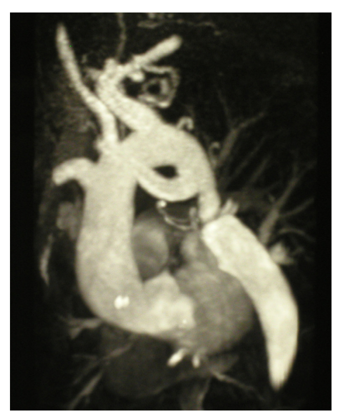
Figure I MRI scan showing the re-coarctation.

heart. The adhesions were released, some of them after establishing cardiopulmonary bypass using ascending aortic cannulation for inflow and bicaval cannulation (to maintain adequate venous drainage even after lifting up