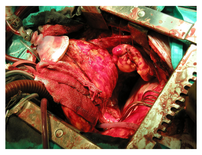
Figure 2 Exposure of the descending thoracic aorta with the apical suction device retracting the heart.

heart. The adhesions were released, some of them after establishing cardiopulmonary bypass using ascending aortic cannulation for inflow and bicaval cannulation (to maintain adequate venous drainage even after lifting up